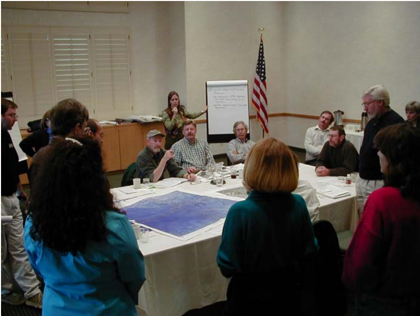
Figure 6. Meeting of the scientific review panel in Palm Desert, 12 February 2001.

by SAC biologists. On the second day, the panel was sequestered without SAC members present, where they reached rough consensus on the key issues and divided up tasks to prepare a formal review document that was released a few months after this meeting, during which time the panel scientists were prohibited from speaking to anyone in the valley. As described in the introduction to this paper, during this second day the panel scientists speculated that the FTL map was different from the other species maps because the SAC didn't have enough data. In their report, they asserted that the MSHCP's credibility was damaged by including species maps constructed according to different standards.