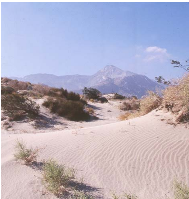
Figure 2. Active sand dune that a Coachella Valley fringe-toed lizard might use as habitat. The quality, geographic distribution, and dynamic history of sandy habitat was a sharply contested issue in this habitat conservation plan.

Some of the credibility of the ARD [administrative review draft of the MSHCP] is damaged by seemingly incongruous information presented in map form or omissions from the documentation.