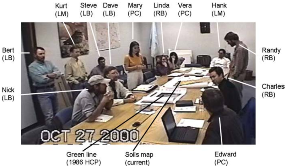
Figure 5. Seating order, participants and active map documents in SAC meeting to discuss conservation plan for an endangered lizard species in the valley. Different professional roles include plan consultants, regulatory biologists, local biologists, and land managers.

DAVE (LB): The hot red? Um, well, these are reflectance values that the computer sees from um, an Ekinos satellite image that’s forming a resolution using color, three color infrared . . . um scanning and it APPEARS based on my field checking and experience out there, that the RED areas are the areas with the most active and um LEAST compacted sand. And in areas within the