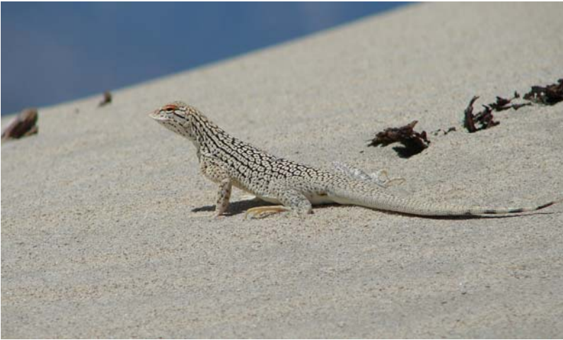
Figure 1. The Coachella Valley fringe-toed lizard, a federally listed endangered species.

SCIENTIST 2: They probably didn't have data.