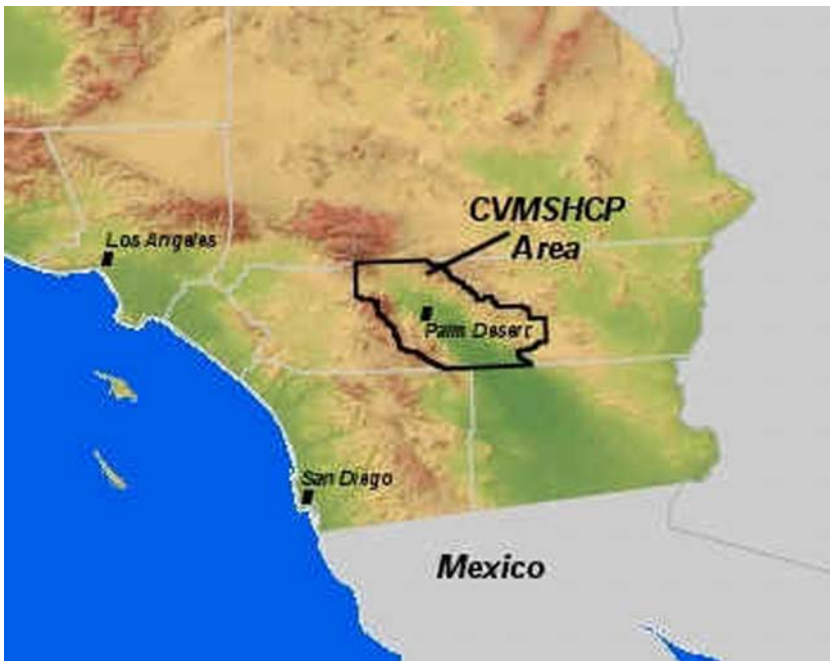
Figure 3. Locational map of the Coachella Valley Multispecies Habitat Conservation Plan area, prepared by the Coachella Valley Association of Governments (CVAG).

Why did the SAC designate a species model for the fringe-toed lizard that projected species movement over geologic time, rather than using projections of its current habitat, the standard employed for the other species in the plan? The answer is not a lack of data, because there was an abundance of information available for mapping its present distribution; indeed, far more data than was available for any other species included within the MSHCP. If this wasn't just shoddy science in action, can this episode teach us about how to assemble credible, legitimate, and authoritative knowledge claims, an increasingly common challenge in high-stakes collaborative planning efforts?