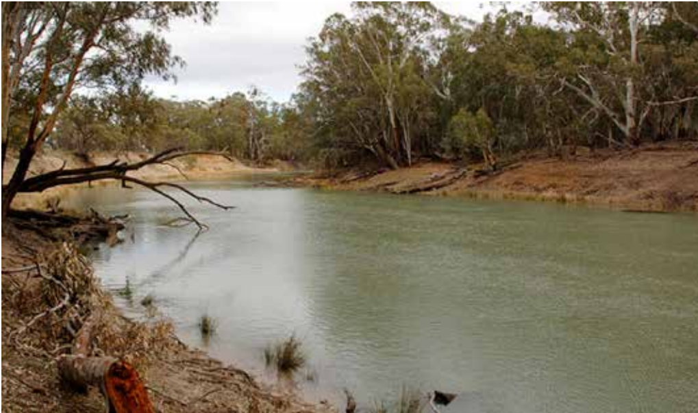
The Murrumbidgee River near Hay in New South Wales.

This issue of Ogmios features a discussion of water allocation in Australia and the Netherlands by CSTPR core faculty member Steve Vanderheiden. It also includes a profile of CSTPR alum Joel Gratz. Feedback welcome! info@sciencepolicy.colorado.edu