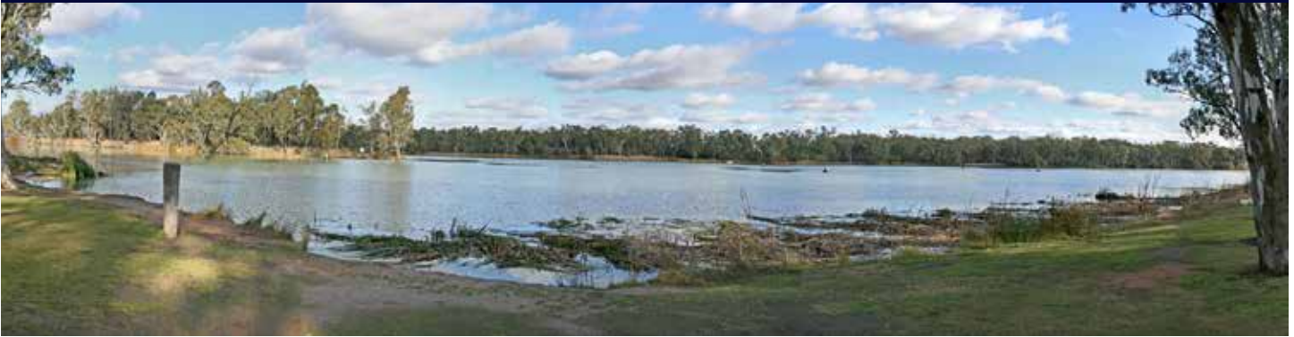
Darling and Murray Rivers at Wentworth, New South Wales.

Since all three are non-extractive uses, the national legal recognition of this category as of highest value requires that some water be left within river basins even in cases of severe drought, prioritizing these to all extractive uses.