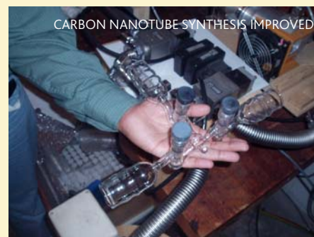
CARBON NANOTUBE SYNTHESIS IMPROVED