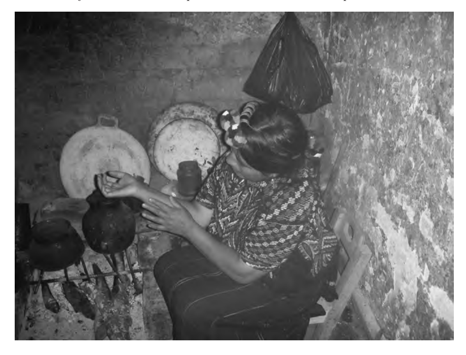
Photo 1.5 A Guatemalan woman dramatizes how she repeatedly burns herself in the same spot on her arm because her open fire is placed in the corner.

In Photo 1.5 this woman is dramatizing how she repeatedly burns herself in the same spot on her arm because her open fire is placed in the corner, and she is forced to reach across pots.