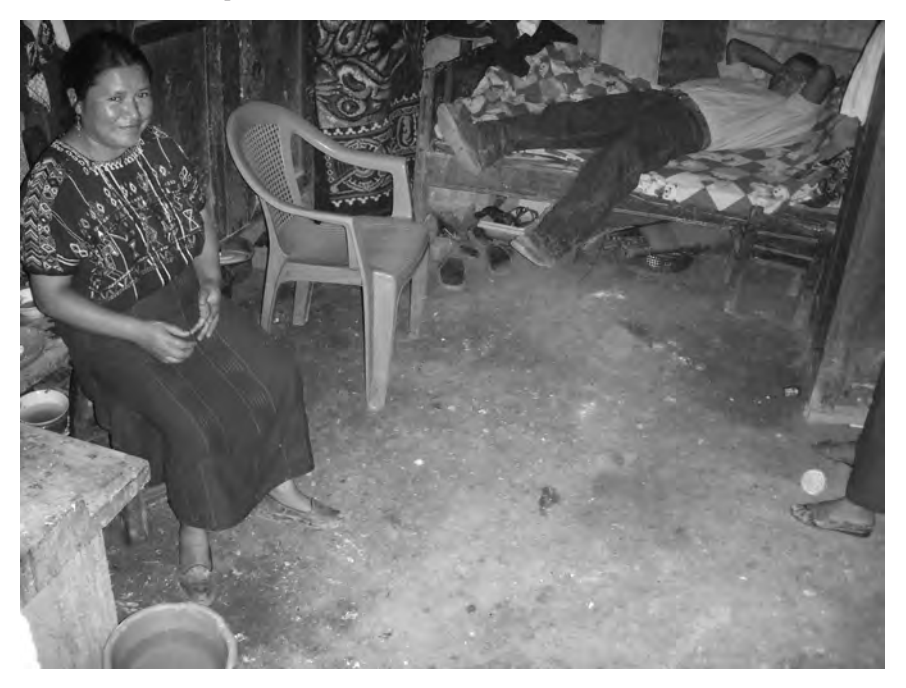
Photo 1.7 A Guatemalan man (right) dramatizes how he can sleep in the same room as his clean-burning cookstove without smoke waking him.

Photo 1.6 This Guatemalan woman is dramatizing how she has a constant headache from the smoke from her open fire.