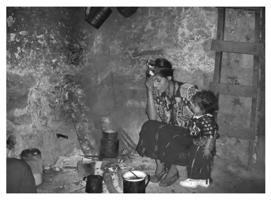
Photo 1.6 This Guatemalan woman is dramatizing how she has a constant headache from the smoke from her open fire.