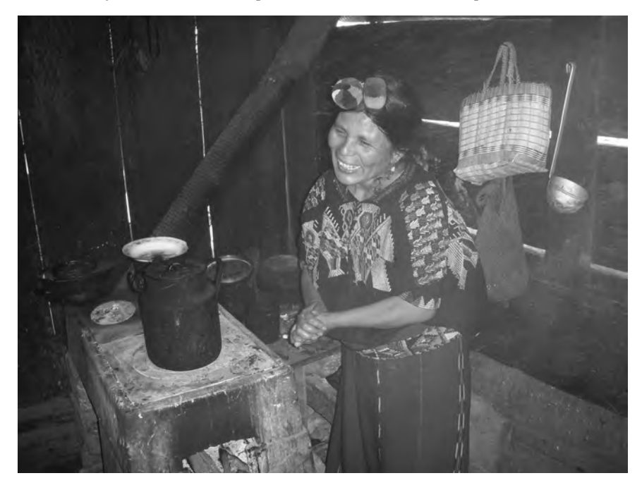
Photo 1.8 A Guatemalan woman pantomiming making a tortilla near her clean-burning cookstove.

stands as a testimony to the untapped potential of people to express for themselves their preferences and values surrounding their own sustainable development