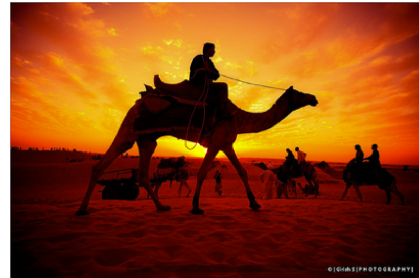
“Use the light”