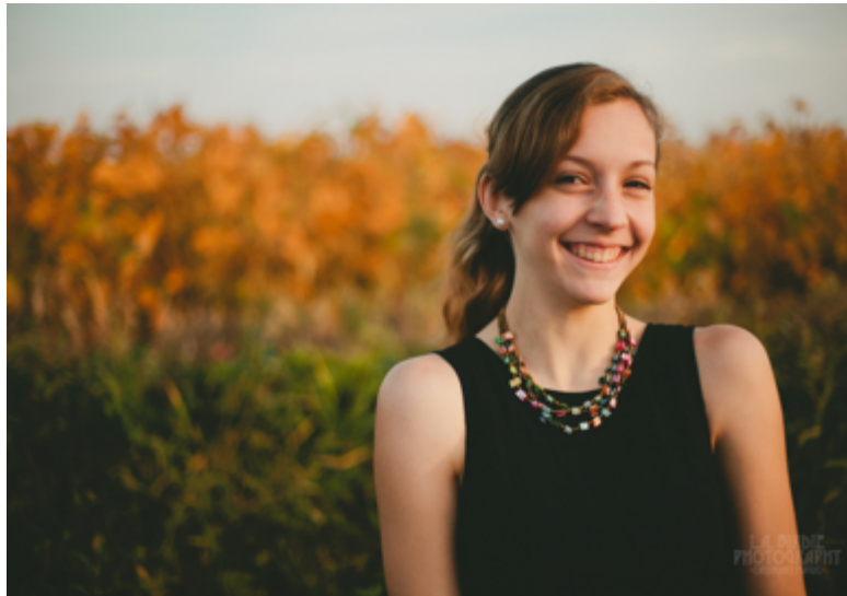
“Use the light”