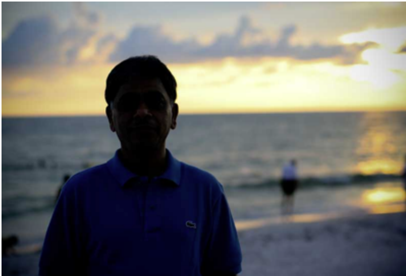
“Fight the light”